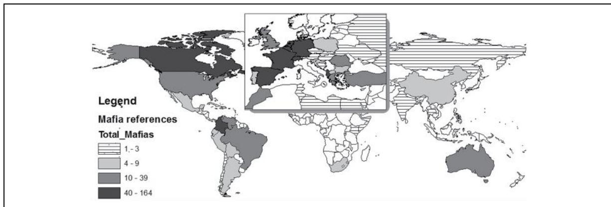
Figure 1. Total references to the mafias per country.

The specific MCA provided a clear representation of the mafias, activities, and countries. It complemented the bivariate analyses by furnishing a synthetic map of the most significant associations and discarding other, less relevant, connections. The first two dimensions identified by the specific MCA describe 57.7 percent and 26.4 percent of the total variance of the data, thus providing a good visual representation of the positions of the different categories. The graph presents different clusters, visually identified by the authors, associating mafias, activities, and countries (Figure 3).